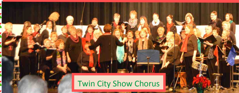
Twin City Show Chorus