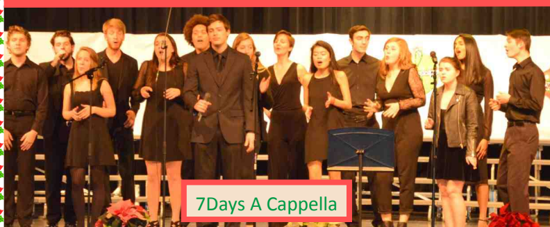
7Days A Cappella