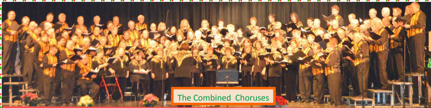
The Combined Choruses