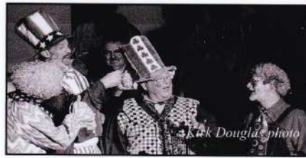
Kirk Douglas photo