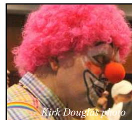
Kirk Douglas photo