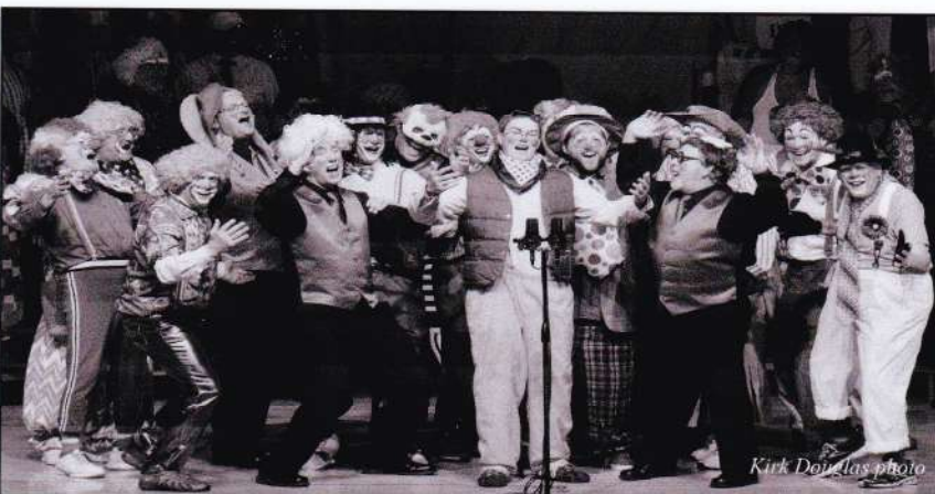
Kirk Douglas photo