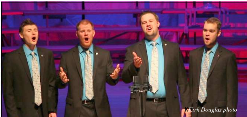
Kirk Douglas photo