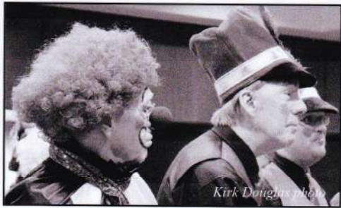
Kirk Douglas photo