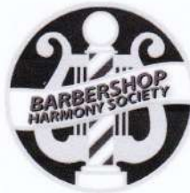
BARBERSHOP HARMONY SOCIETY