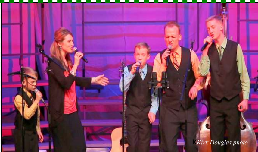
Kirk Douglas photo