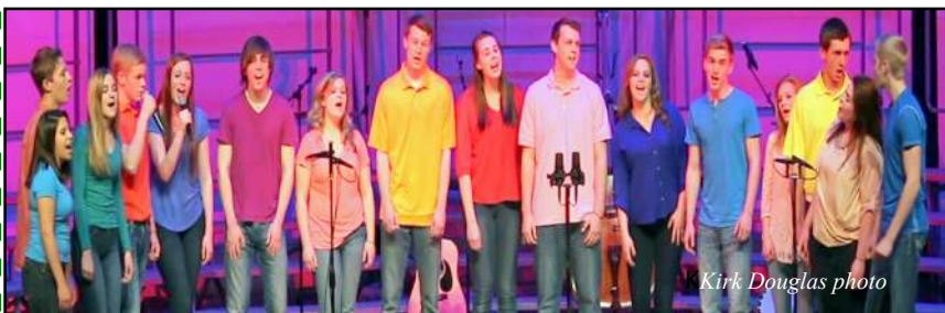
Kirk Douglas photo