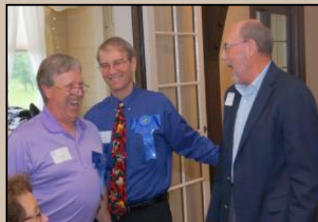
The moment of truth!