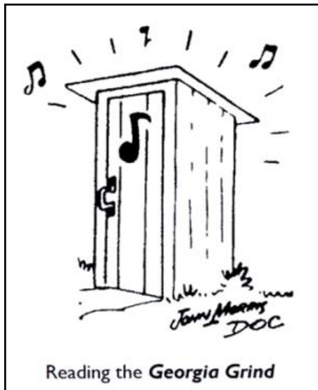
Reading the Georgia Grind

But, don’t let me lead you to think that my research is all drudgery. One place on the better side of my search