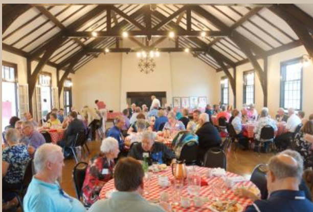
The venue at the Manor