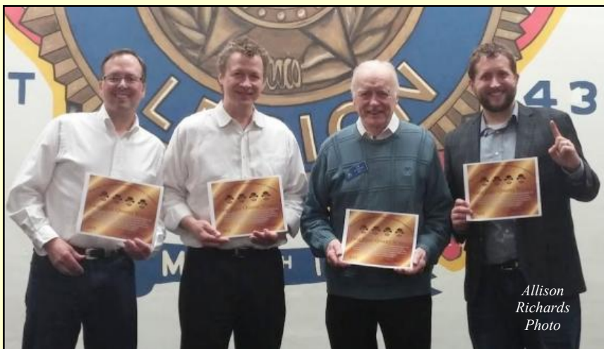
Allison Richards Photo