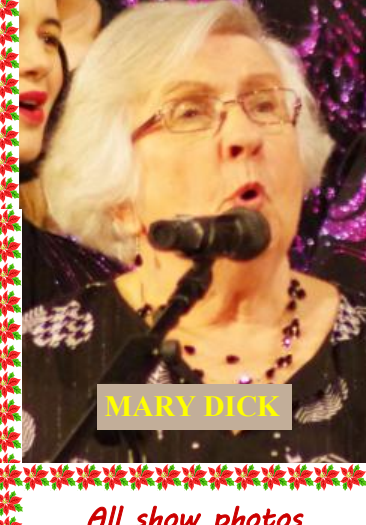
All show photos courtesy of Wayne Rasmussen