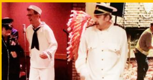
"IN THE NAVY"