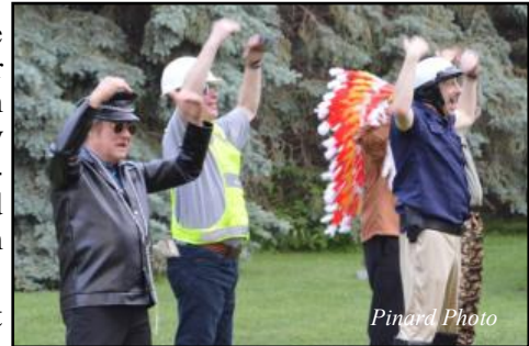
YMCA the Commodore Way in Osseo

Sunday afternoon, June 25, found the Minneapolis Commodores in the MacMillan Auditorium at the Minneso -