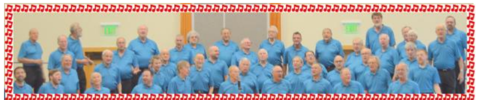
The Commodores at the Arboretum on June 24.