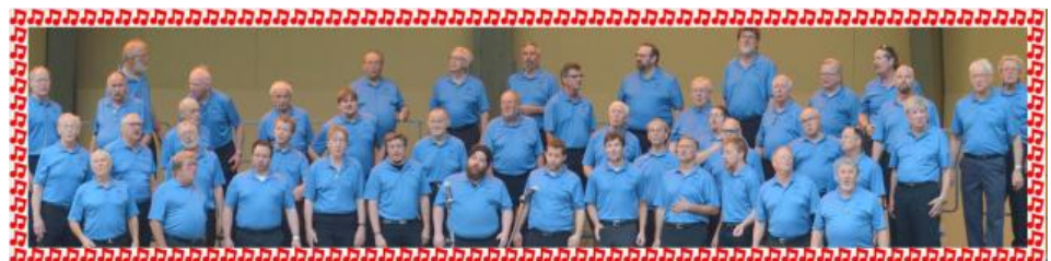
The Commodores at Roseville on June 14.