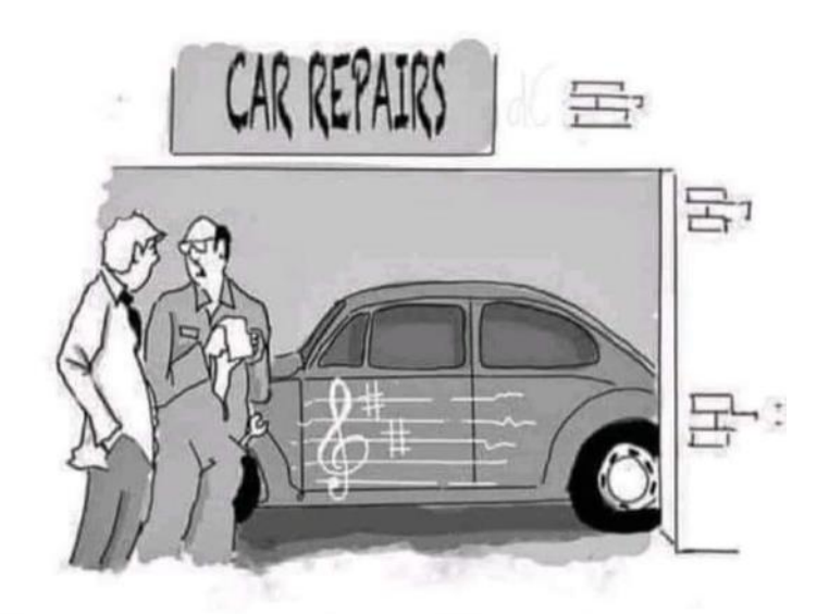
"Your car has been keyed. The good news is that the damage appears to B minor."