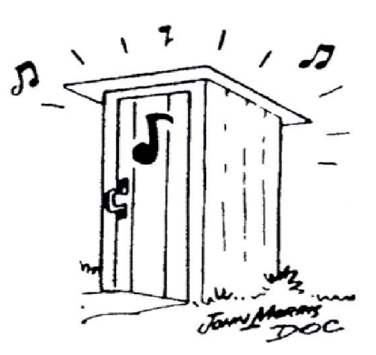
Reading the Georgia Grind

Obviously, I don't keep count, but I do know that the repetitions are mind -boggling. Some are just on the difficult or tricky parts where I need to lock in the notes or words. Others are just for the fun of it. By the time of the Brigade weekend I feel I am pretty well set and have enjoyed the musical journey.