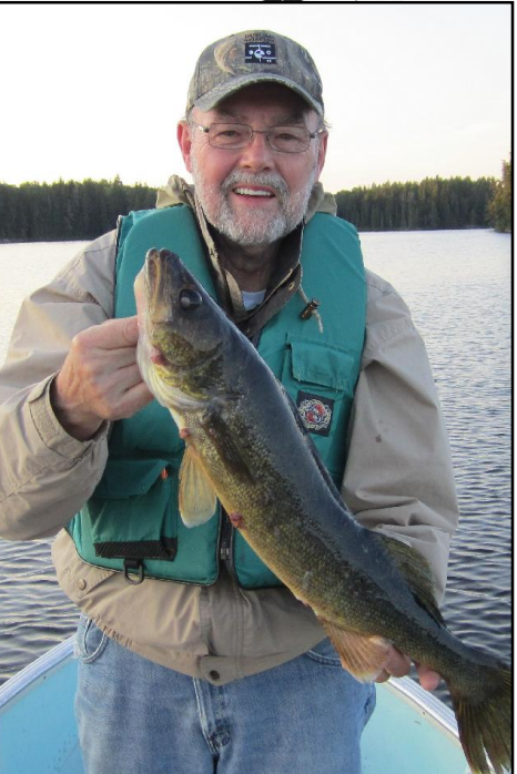
Rich and a lunker Ongna photo