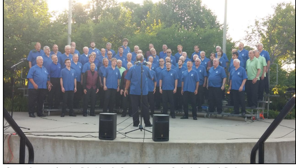
Commodores performing July 16 at the Summer Concert Series in St. Louis Park.