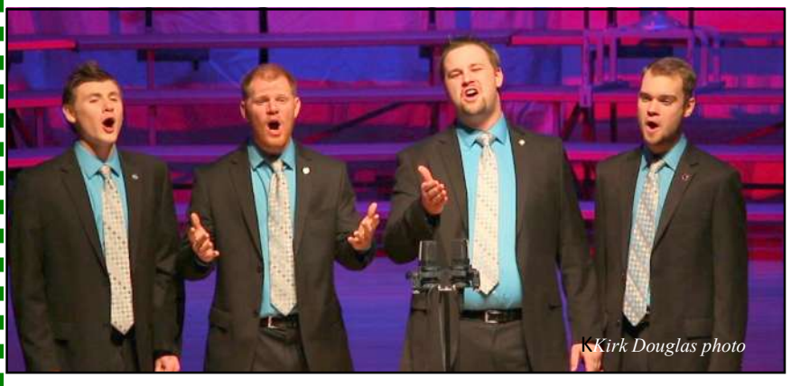
Kordal Kombat - 2013 LOL District Quartet Champions