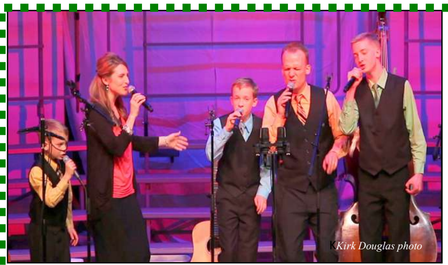
The Benson Family Singers