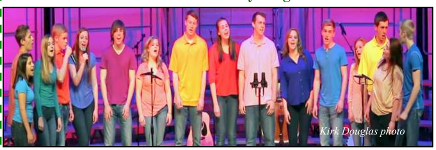
The Now & Then singers from Lakeville North High School