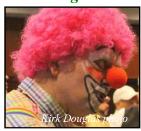
Experiencing the life of a Clown